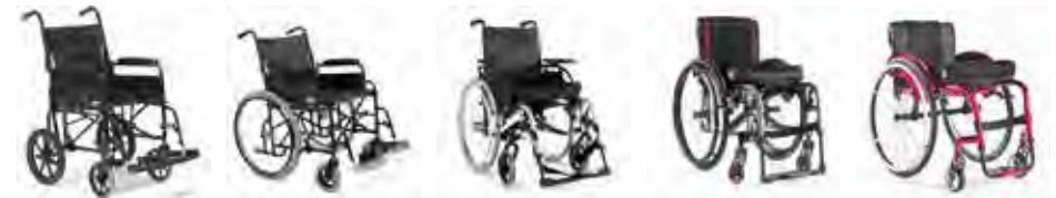
Standard NHS manual wheelchairs

The typical core equipment range is shown below.