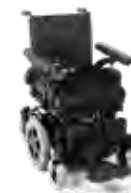
Salsa M2 Mini