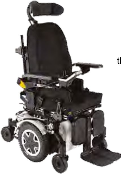
Chair: Quickie Q400M PWB Options: Backrest recline, enhanced joystick, lights and seat riser

Configurable with a range of seating options, the TDX SP2 is suitable for those who want function and style combined.