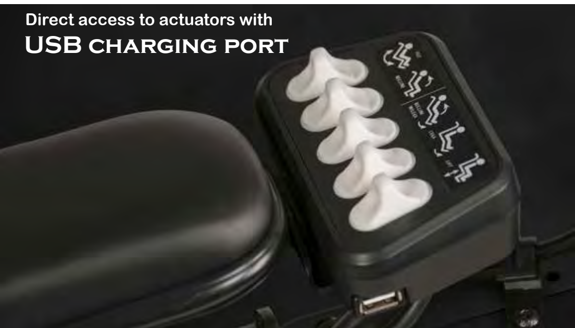
Direct access to actuators with USB CHARGING PORT