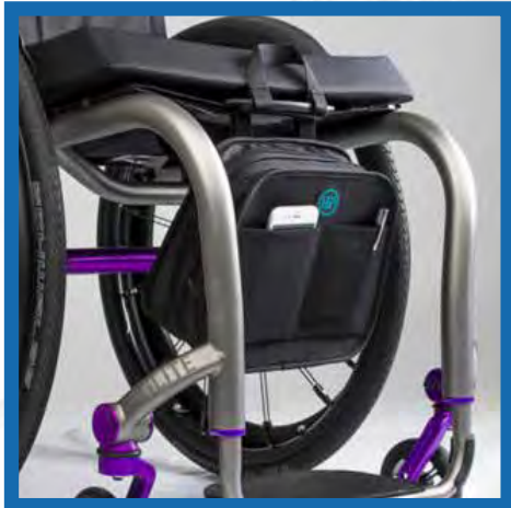
Removable storage bag