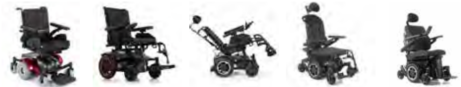
Standard powerchair provisions