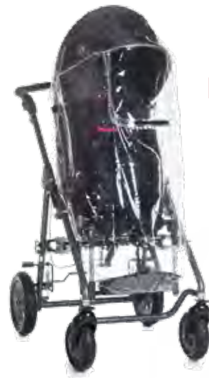
Rain covers and sunshades