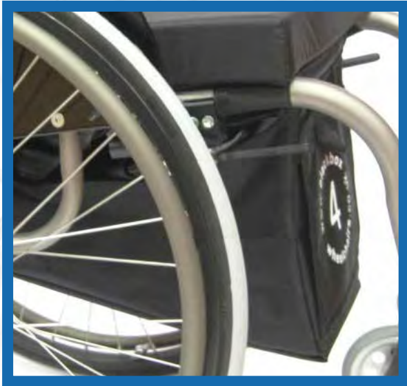
Black box under chair storage

Handy carrying solutions for all your stuff.