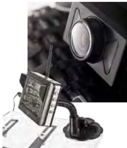
Reversing cameras (parking sensors)