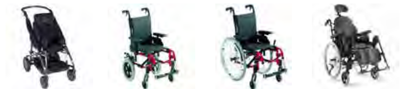
Paediatric and passive provisions