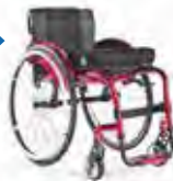
Quickie Argon 2